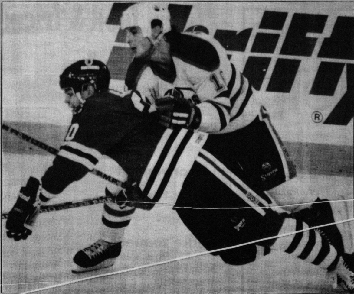
Only 15,900 saw Chicago's Mike Eagles score three points against the Oilers on Sunday.

Maybe we should call Edmonton the "City of Fickle Fair-Weather Sport Fans". They have deserted the Oilers now that Gretzky is gone. They have deserted the Eskimos since the departure of Warren Moon. They have deserted professional soccer completely. They won't have the chance to desert the Trappers, because City Hall has tied the hands of the owners and forced them to play in a ball park that made the Durham Bulls look like major league.