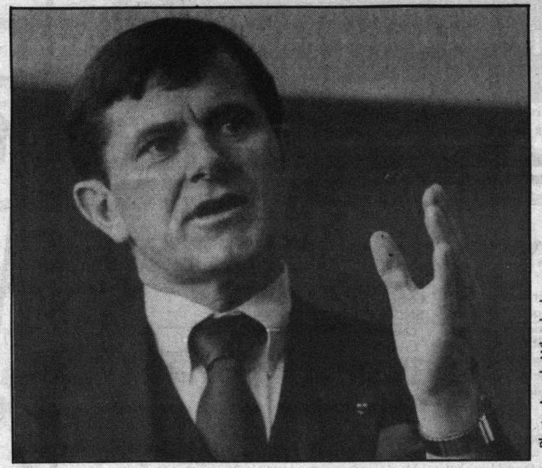
... and speaking to U of A students as NDP leader in 1983.

"There's a greater tragedy, greater than his death, we New Democrats must prevent the death of his vision.