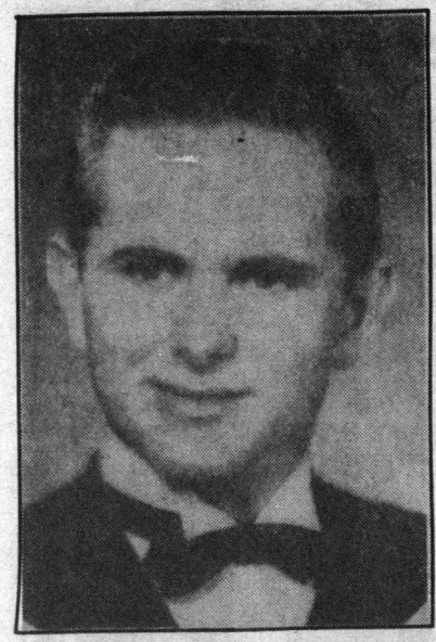
Notley as leader of the U of A CCF club