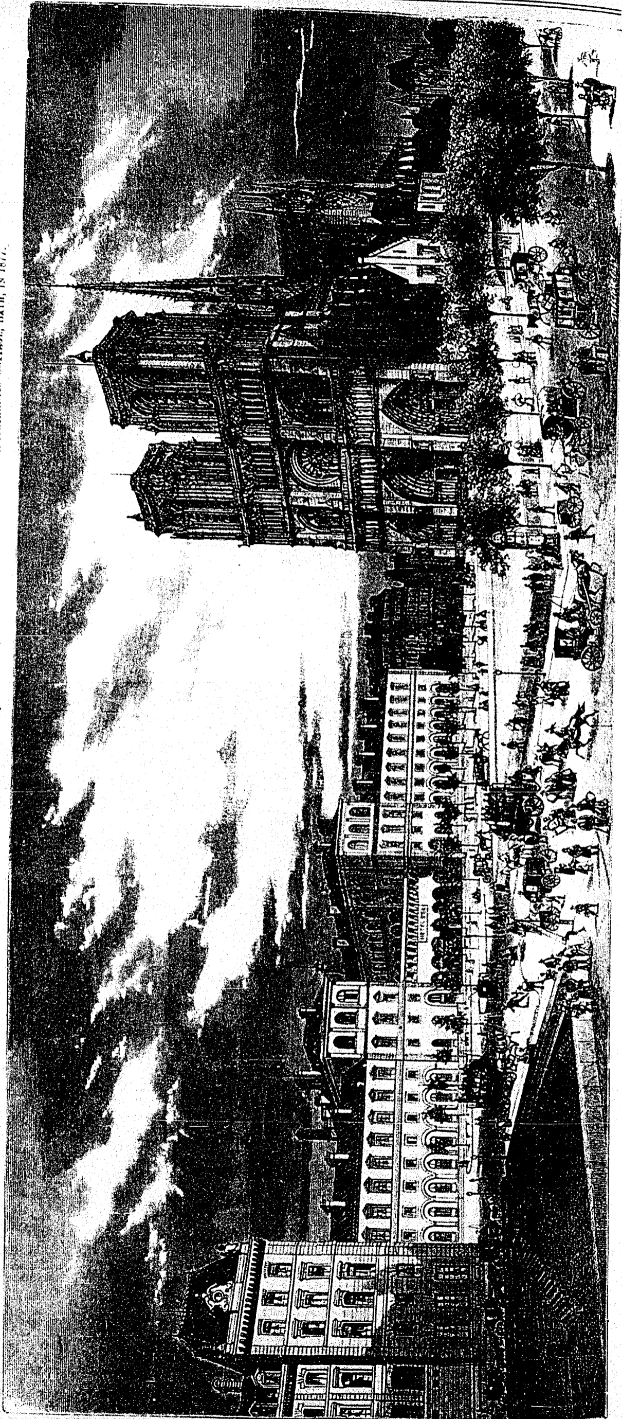
PARIS.—THE NEW SPACE IN FRONT OF NOTRE-DAME AFTER THE DEMOLITION OF THE HOVER PATH.