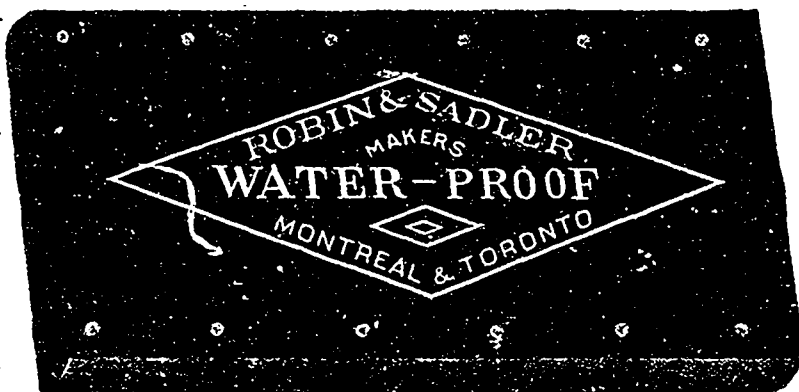
THE ABOVE CUT REPRESENTS A SECTION OF OUR WATERPROOF BELTING.

This Belt is made in both Light and Heavy Double Leather of the best material, fastened with Waterproof Cement and Brass Wire Screws, after which the entire belt is saturated with a preparation which renders it entirely waterproof.