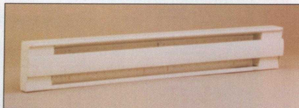
Ouellet manufactures a full line of residential electric heaters.

Available in beige, white or light grey, all Ouellet heaters are CSA approved and many are UL listed.