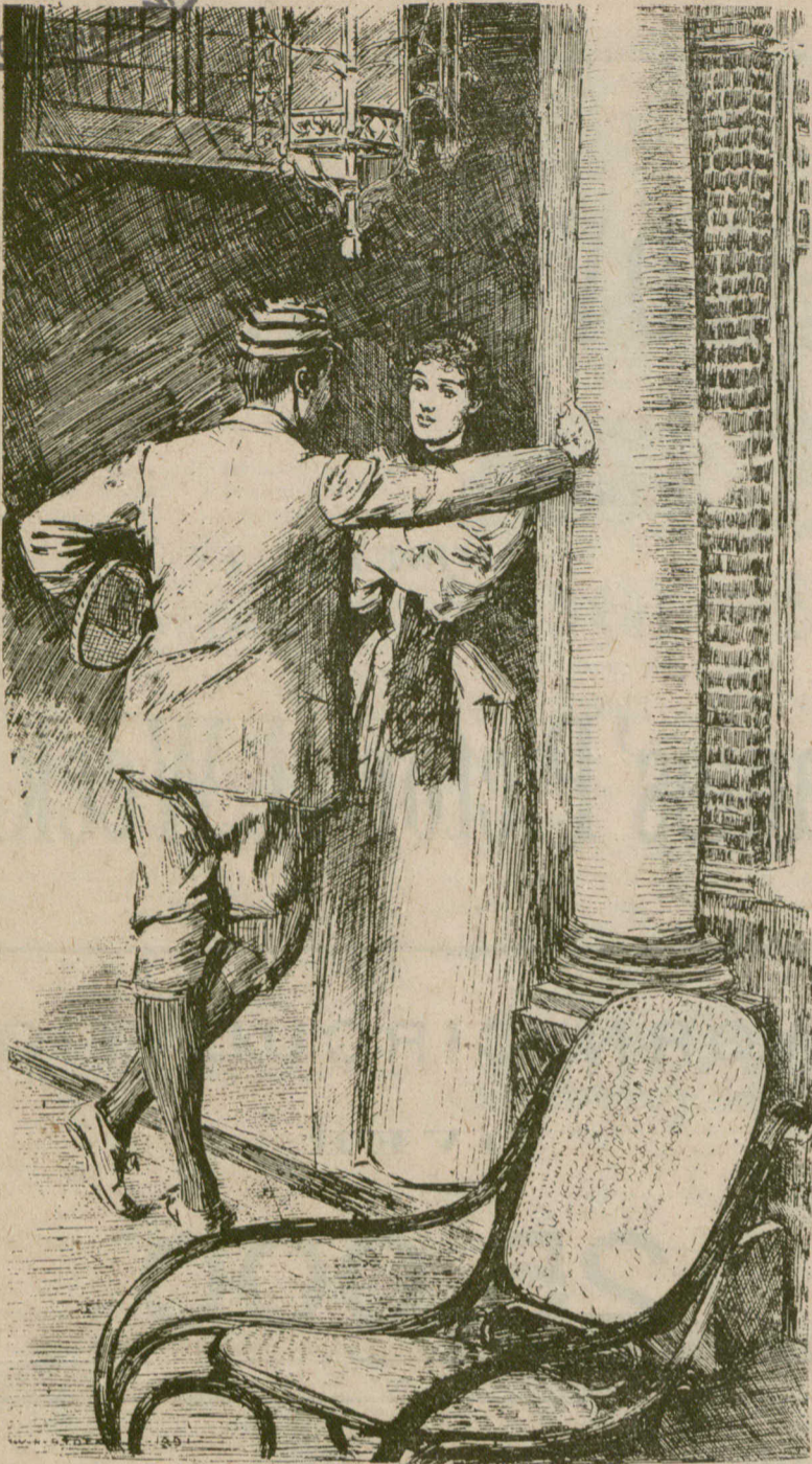
BEFORE THE PROPOSAL.

SHE—"I feel like a cake of ice this morning." HE—"That's good. Perhaps when the sun comes out you will be in a melting mood. I'll have something to say to you then."