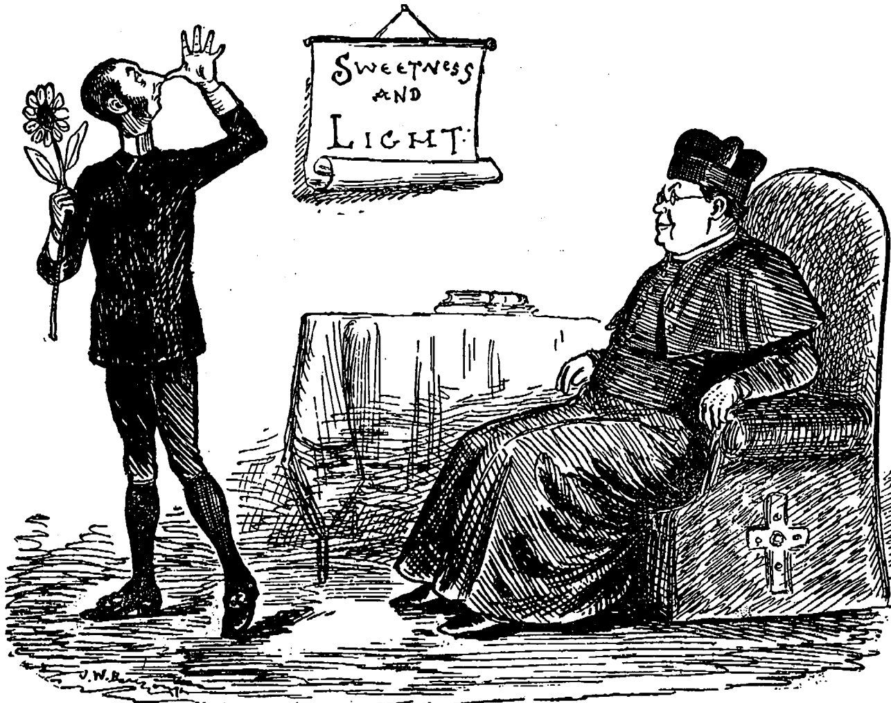
THE EDITOR OF THE "MAIL" GIVING THE ARCHBISHOP A LESSON IN "CULCHAW."

Photographer, 134 Yonge Street, Toronto. Stanton Cabinets, $3.00 per dozen. Old Pictures Copied, Enlarged and Finished in Colors, Ink or Crayon. Orders filled from any Negatives made by the firm of Stanton & Vicars.