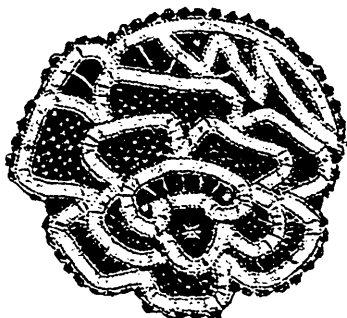
No. 611. ROSE DOILY. Price of Pattern, 7 cents.

An exquisite centerpiece, No. 616, is made of pale blue silk with a border of lace, the braid being fine white Duchesse, and the stitches in blue silk to match the center. Another novelty in this charming little creation is the introduction into the lace of medallions of white on which are embroidered forget-me-nots.