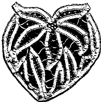
No. 612. LILY DOILY. Price of Pattern, 7 cents.

Instead of being embroidered they may be purchased ready made and applied to the net.