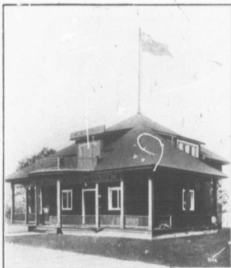
JAMESTOWN EXPOSITION. Grand Trunk Railway System's Building.

and carnivals add to the splendor of the occasion. The great battle between the Merrimac and Monitor is reproduced in the same position these ironclads occupied when they had the terrible battle in 1862. This event occurred just off the point on which the Exposition is located.