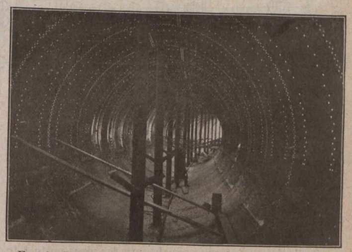
FIG. 2—DOUBLE-RIVETED LAP JOINT IN 18-FT. DIAMETER PIPE, ONTARIO POWER CO.

Where the thickness of the plate is dependent upon factors other than the internal pressure, such as rigidity of the section against collapsing, the type of joint depends