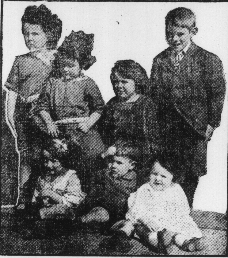
The Immigrant Tide to Canada. Some Recent Pictures.

born as leaders in the professions, migrants who helped to build up and in the Cabinet of at least one Provincial Government. Canada is after all only repeating on a larger scale the welcome to and the assimilation of the foreign born which has characterized the history of the Mother Country. The Flemish weavers and the Huguenots who found refuge in England, are a few of the foreign born im-