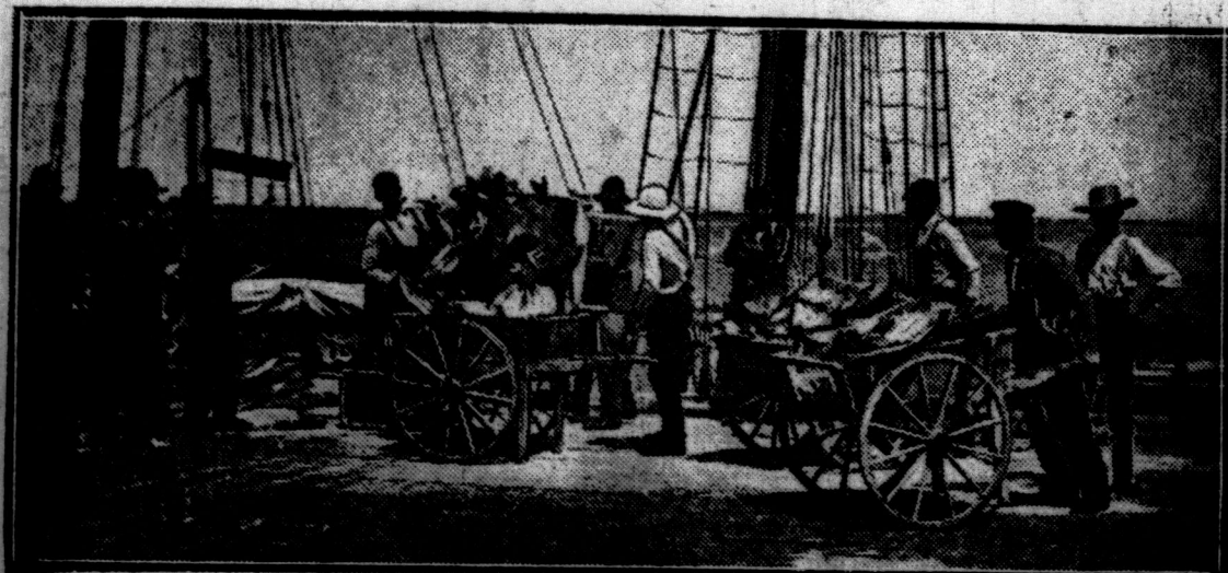
A picturesque scene in a Nova Scotia port. Handling the fish as the boats bring in their catches.