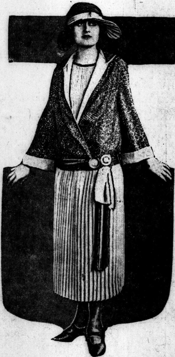
A smart two-piece affair from Paris. The jacket has bell sleeves and the skirt is of tan Canton crepe knife pleated.