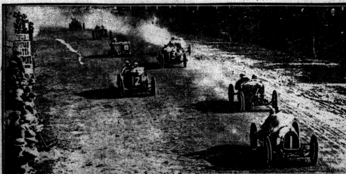
Britain, represented by Seagrave and Divo, took first and second places in the Grand Prix motor race. The photo shows the cars passing the tribunes as the race commenced.