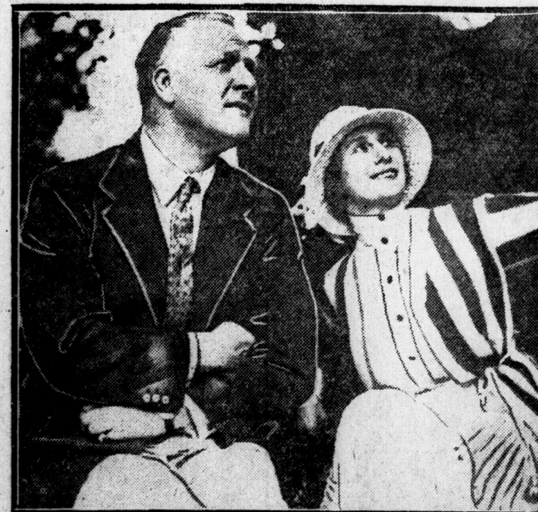
M. Pavlowa and M. Feodor Chaliapin, famous Russian vocalists, at a farewell garden party held at the famous dancer's English home.