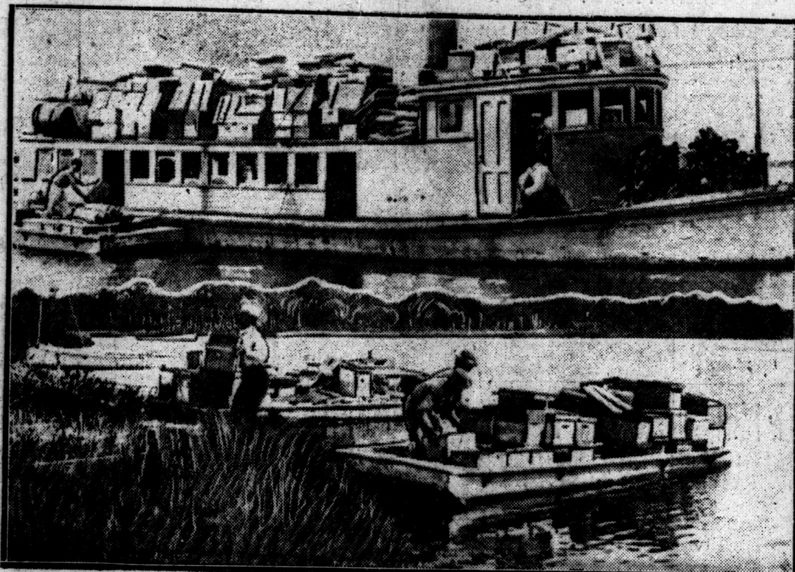
This may have all the outward appearances of a rum running crew at work on the Atlantic coast but in reality it is nothing more than a shipment of bees up the Indian River in Florida