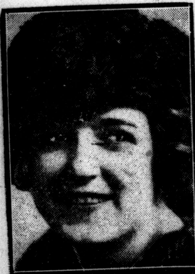
An outstanding bit of portraiture exhibited at a recent photographers' show by Ross R. Fleury of Windsor.