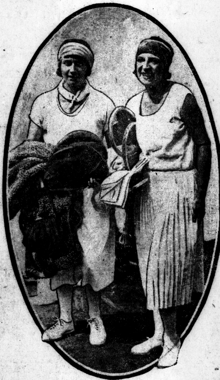
Miss Lenglen and Miss Kitty McKane snapped together as they arrived for their match at Wimbledon. The French girl won and thus retained the world's championship.