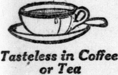
Tasteless in Coffee or Tea

Just enough to cover a 10 cent piece taken every morning in your breakfast cup of coffee or tea, will make all the difference in the world. All impurities are removed from the body, the blood stream regains its purity, the whole sluggish system responds to its energising influence. You work better, play better, live better when you take the little daily dose. Try it yourself. Get a bottle to-day and start the healthy Kruschen habit at once.