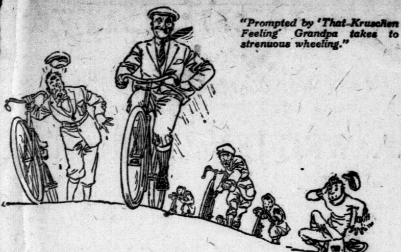
"Prompted by 'That-Kruschen Feeling' Grandpa takes to strenuous wheeling."