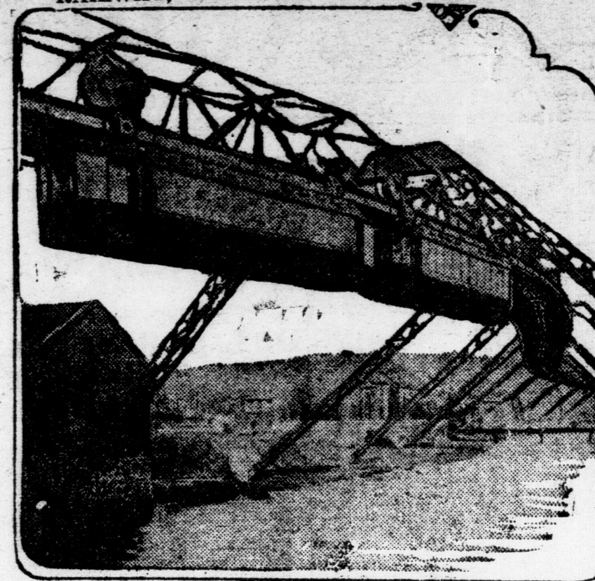
The Monorail Line Capable of Unheard-of Railway Speed.