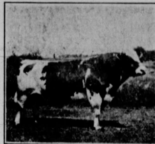
'Sir Pietertje de Riverside'