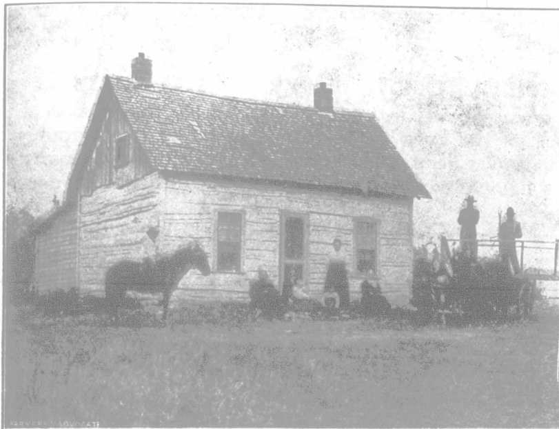
A NEW SETTLER'S FIRST HOME

From the United States, the British Isles and Continental Europe, a steady stream of settlers has been pouring into Canada, totalling in all for the past 12 years over one and one-half million souls.