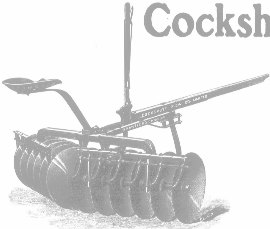
Cockshutt Disc Harrow—15 sizes.