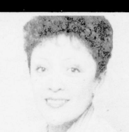
FOR VIEWING PLEASE CALL JENNY MOORE BUS: 270-8840 - RES:

This ranch bungalow stone fireplace in iving room. 3 bedrooms, modern eat-in kitchen finished family room with walk-out to back yard. Set in mature treed area. A lovely buy at $84,900 and financing. Call Jenny Moore 270-8840. Perfectly clean home shows