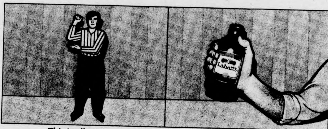
This is elbowing.