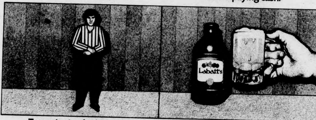
Two minutes for holding.