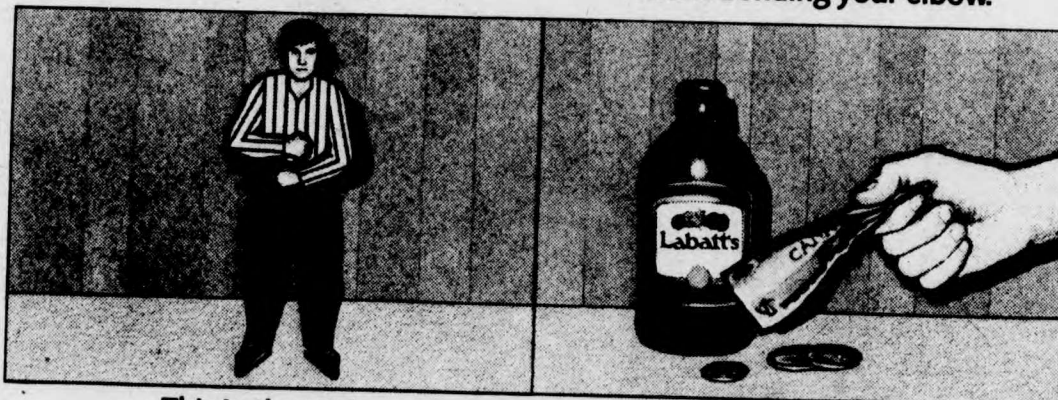
This is charging.