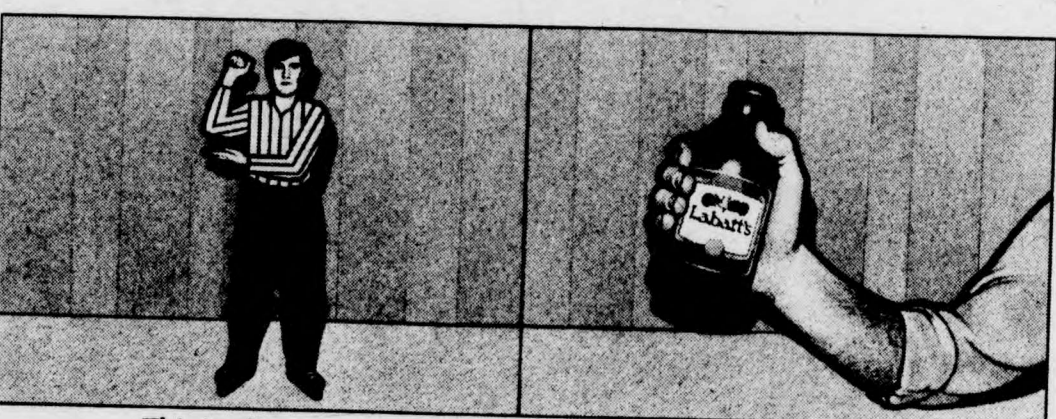
This is elbowing.