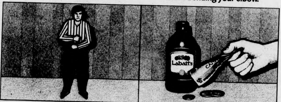
This is charging.