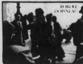
L'Hotel de Ville