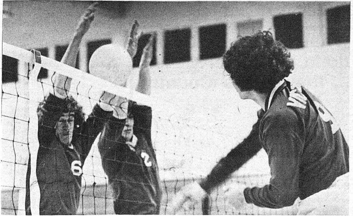
The Golden Bear Volleyball team opens its season in Calgary this weekend