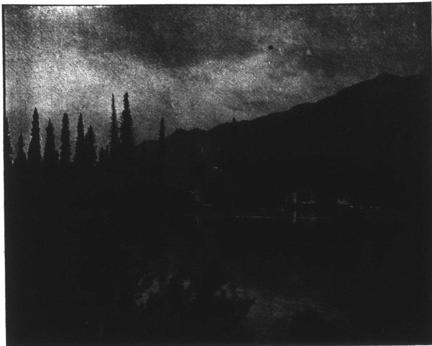
THE RIVER AT BANFF.

Penmanship, Short- hand, Typewriting, business subjects thoroughly taught. Write for particulars. Catalogues free. Address WINNIPEG BUSINESS COLLEGE, 401, Portage Ave. and Fort St., WINNIPEG.