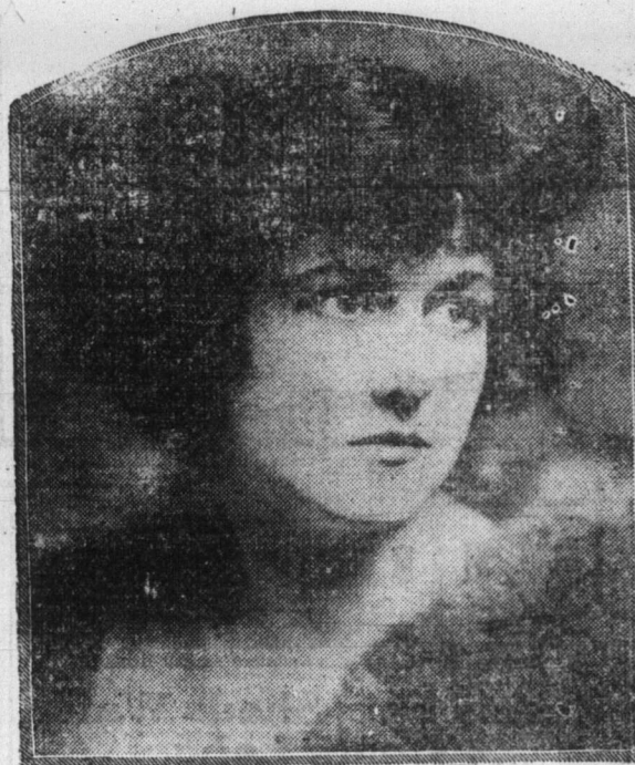
PEGGY HYLAND DIRECTION WILLIAM FOX STAR, Mon. Tues. Wed.