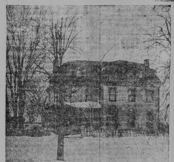
The Fredericton Home of Lieut.-Covernor Snowball

and on the second floor are the board of works and agricultural departmental offices, also the offices of the lieutenant governor, attorney general, clerk of the xecutive council and executive council hamber. The last named, where the meet-