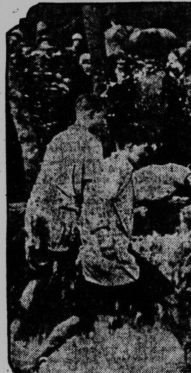
Foot racing in England is strenuous sport. Here the entrants in the senior steeplechase of Bradford College are passing through the weir, one of the many obstacles in the novel race.