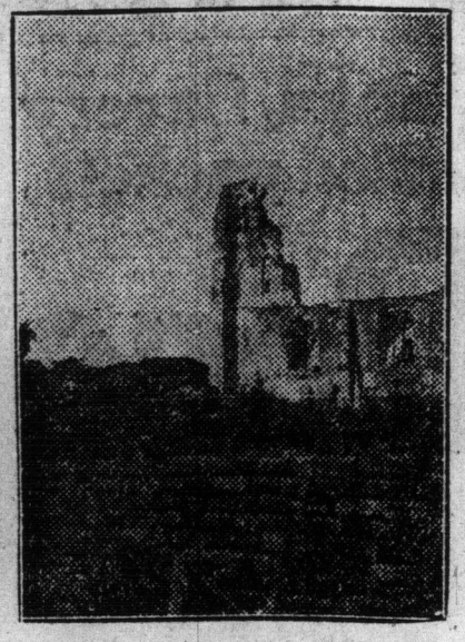
showing ruins of Flanders churches wrecked by German shell fire.