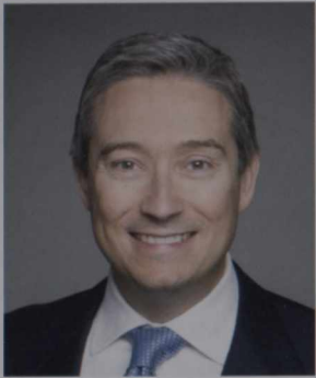
The Honourable François-Philippe Champagne Minister of International Trade

Trade is in Canada's DNA—and Canadian business women, like you, are crucial to our economic success.