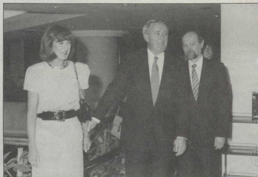
Prime Minister Brian Mulroney with Mrs Mila Mulroney and Canadian High Commissioner Garrett Lambert, during the Commonwealth Summit in Kuala Lumpur

Canada's proposals to strengthen structured support for the Commonwealth Games, next scheduled to be held in 1990 in New Zealand and 1994 in Victoria, British Columbia, were endorsed by the heads of government, as was a Canadian initiative to strengthen the role of the Commonwealth in assisting member countries in respect of human rights. To mark the 40th anniversary of this august organization, Canada also donated 40 scholarships for deserving Commonwealth students.