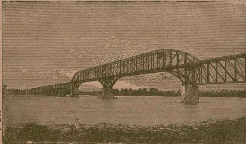
ST. LAWRENCE RIVER BRIDGE, CANADIAN PACIFIC RAILWAY, LACHINE, P. Q.

For Railways and Highways, Iron Bridges, Turntables Iron Piers and Trestles Bridge Rods Right and Left Hand Sleeve Nuts and all kinds of Structural Iron Work.