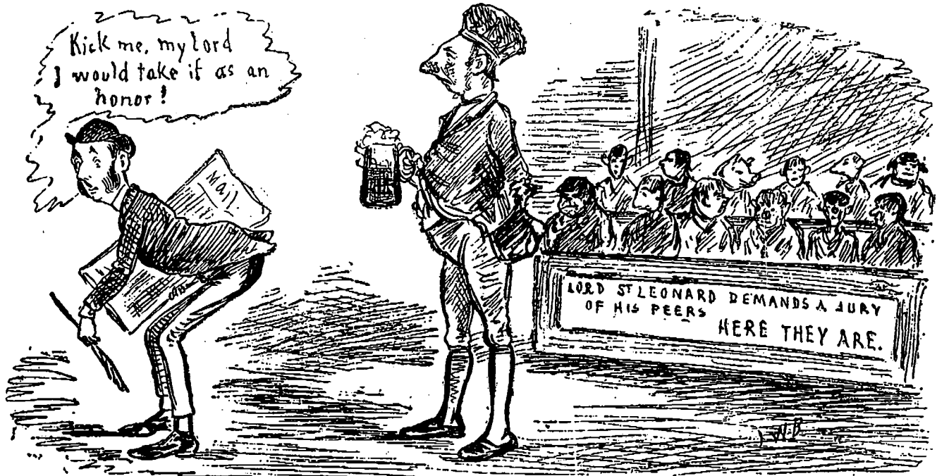
ATTITUDE OF THE MAIL TOWARDS THE PEERAGE.

Book larnin' isn't all a gal wants ter know. Eddication they must have, of course, but also teach them to be natural, charitable, unselfish and useful. Build yer gal's character on this foundation and she'll grow up beautiful. Teach them that paintin' their faces, squeezin' their waists and frizzin' their hair 'll never make 'em nice. Physical beauty is natral, not artificial. Don't send your darter to boardin' school till she has graduated in kitchen arts. An eddicated gal with no knowledge of cookery or housework is like a silver-plated door-mat—very much out of place as an ornament and a total failure as ter usefulness. Mothers, do your duty by your gals and they'll bring you just as much honor as your boys. Gals, with all your gittin', git common sense.