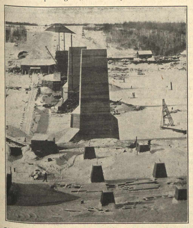
Piers Nos. 1 and 2, completed, Clover Bar Bridge, Alta. will cross the Saskatchewan River, and will have a total length of about 1,560 feet. It is estimated that its cost will be in the vicinity of a quarter of a million dollars.

the site of the bridge a spur line is now being constructed to the Canadian Northern Railway. Meantime work on the bridge has been suspended, everything being in readiness for placing the steel into position. The bridge