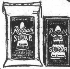
2 and 5 lb. Cartons—10, 20, 50 and 100 lb. Bags.

No one ever doubts REDPATH quality, because in its Sixty Years of use no one has ever bought a barrel, bag or carton of poor Redpath sugar. It is made in one grade only—the highest.