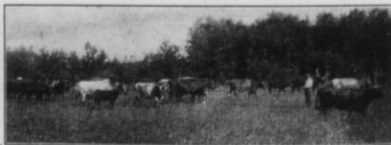
Some of my Shorthorns at Pasture.

I wish to inform my numerous friends and patrons, that after military service in France, I have again taken over the personal management of my Shorthorn herd at Glenalmond Stock Farm. My herd includes a fine lot of young cows and heifers, representing the most desirable lines of breeding, and these are mated to high-class herd bulls. I will have some choice young stock for sale next spring.