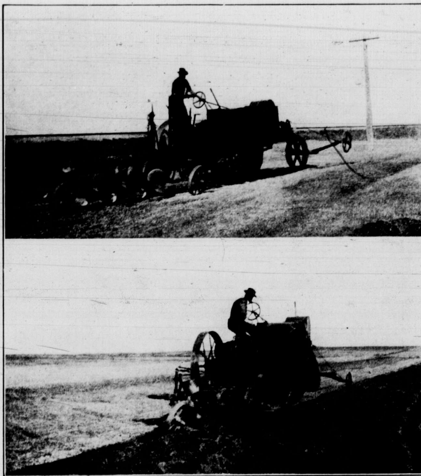
Above can be seen the Grain Growers' Special with Steering Device raised while turning, and below the device in place guiding the tractor.

When selling grain or buying farm needs, do all the business you can with the pioneer farmers' company. Wagons, Buggies, Haying Machinery, Manure Spreaders, Woven Wire Fencing, Barb Wire, Fence Posts, Binder Twine, Lumber, Building Supplies, etc., etc.