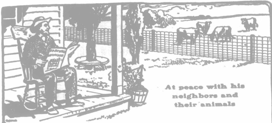
At peace with his neighbors and their animals