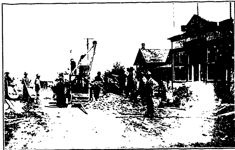
1 MILE'S GRANOLITHIC WALKS Under Construction