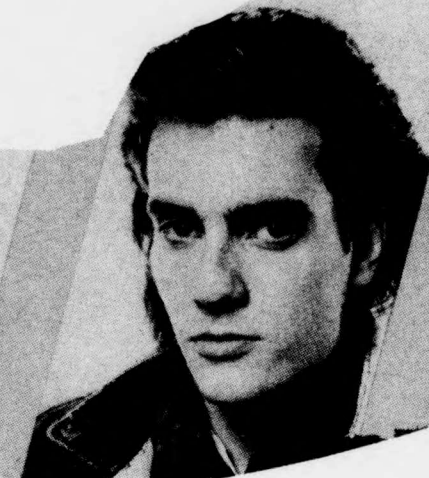
The Lady's Man