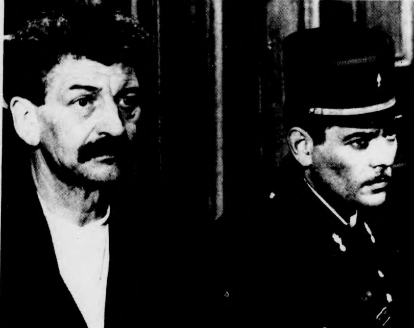
A scene from Special Section, Costa-Gravas' latest film, starring Robert

The filmmaker also suggests that when the times comes for the government itself to act illegaly witness Watergate - someone can always be found in the bureaucracy to do the dirty work. Whether they