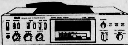
Akai is the Big Cheese in Amplifiers.