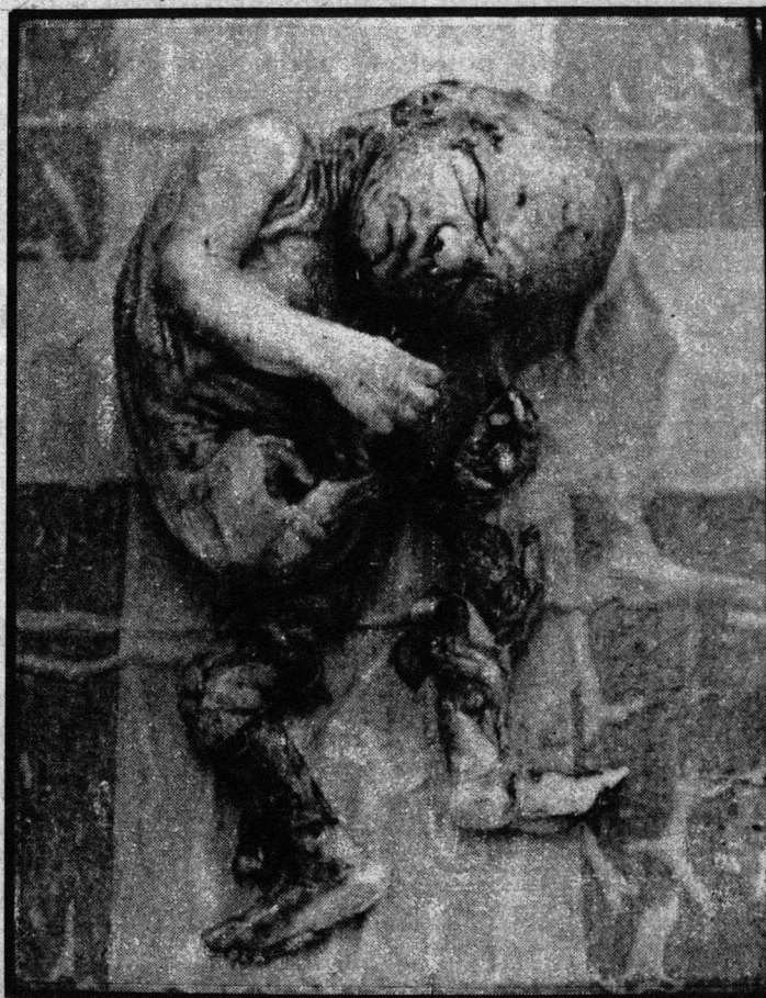
This photograph was taken from the pamphlet "The American Holocaust". The pamphlet was removed from the Right To Life Table in SUB by order of the SU Executive.