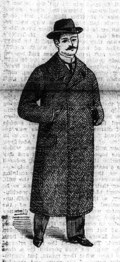
This is the MEN'S ULSTER we talk It is the best $5, Ulster in Canada.

Ready-To-Wear Clothing for Men and Boys, equal to Custom Made. Fits as well-Looks as well - Wears as well.