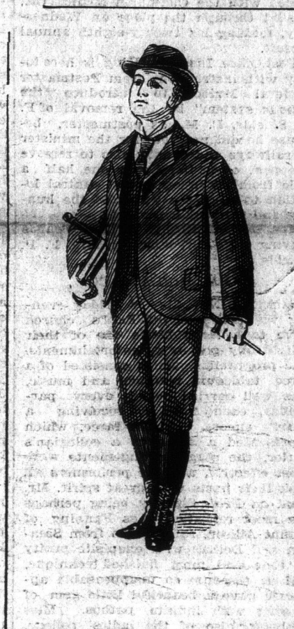
Great value in YOUTH'S SUITS a