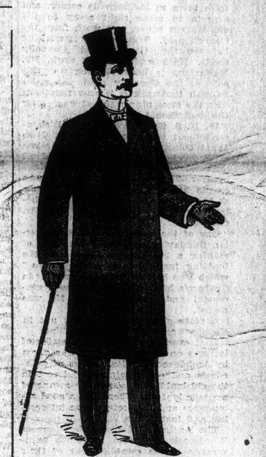
A stylish perfect fitting well made overcoat of BLUE MELTON .... $13 90. Equal in all points to custom made.