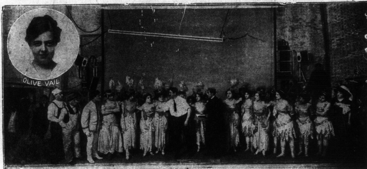
THE FAMOUS DRESS REHEARSAL SCENE IN "MISS NOBODY FROM STARLAND," THE BIG MUSICAL REVUE, AT THE GRAND OPERA HOUSE THIS WEEK.