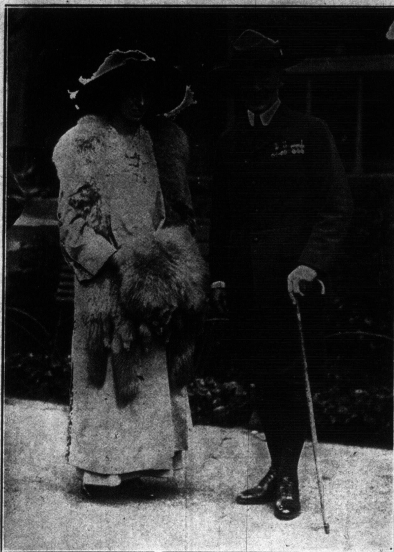
GENERAL BADEN POWELL AND LADY BADEN POWELL.