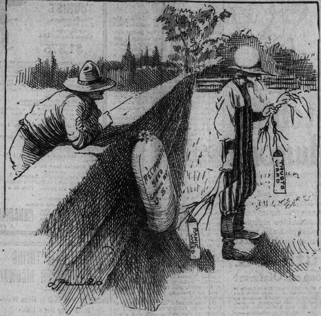
FARMER CANUCK: You've got too many weeds over there, Sam. I don't think I'll