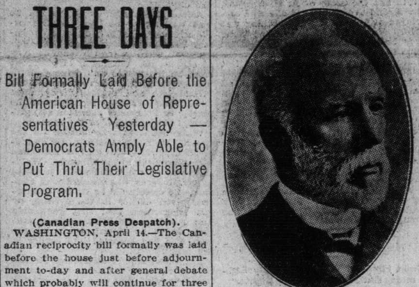
SIR ELZEAR TASCHEREAU.