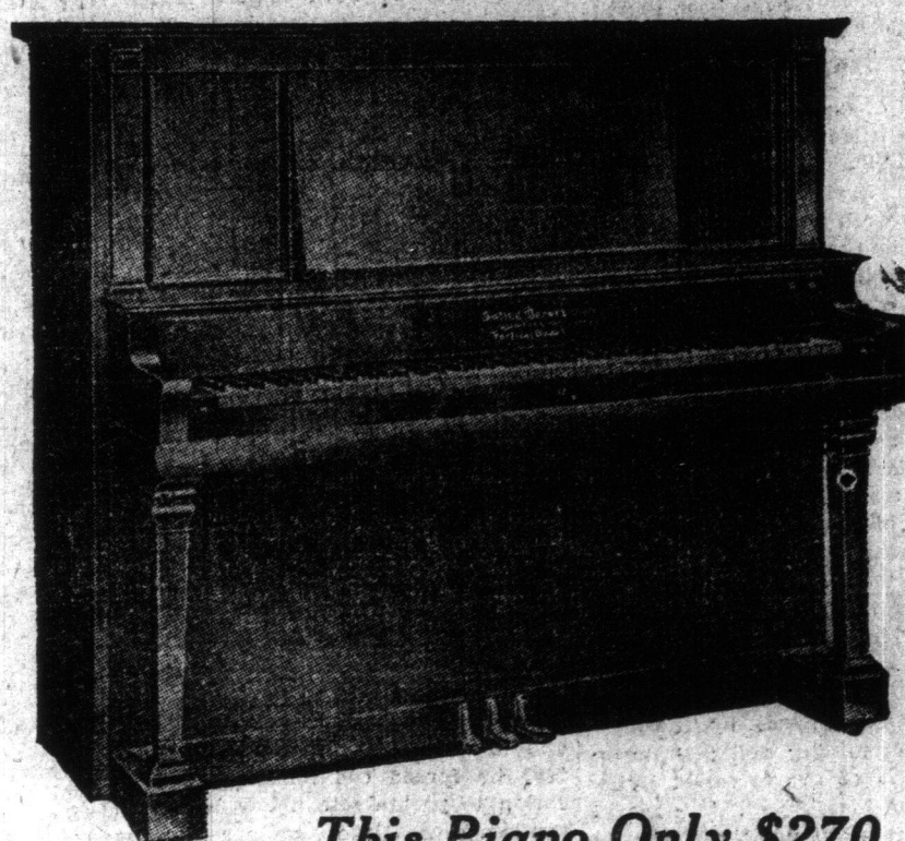
This Piano Only $270

ALL PLAYERS ARE FULL 66-NOTE UNLESS EXPRESSLY SPECIFIED.