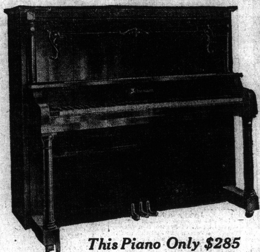
This Piano Only $285

SCHUMANN—Finished in exquisite mahogany, with full swinging double repeating action and overstrung scale, giving rich, full tone and exquisite touch. This instrument has been in use for a brief time for demonstration purposes. Original price $350. Sale price ..... $285