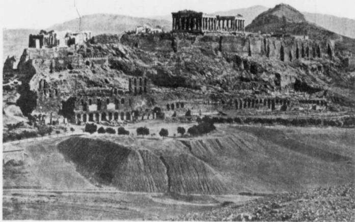
The Acropolis, Athens.

THE Acropolis, literally the highest point of the city, is surmounted by the ruins of the Parthenon, the masterpiece of Ictinus, the architect. "The Old World's culture culminated in Greece—All Greece in Athens—All Athens in its Acropolis—All the Acropolis in the Parthenon."