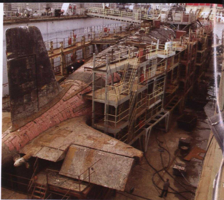
Victor I being dismantled in floating dock

The EBRD manages the NDEP Support Fund on behalf of donors (including Canada, Finland, France, Germany, the Netherlands, Norway, Russia, Sweden, the U.K. and the EU). Canada works with its international group of donors to review and approve projects and monitor progress.