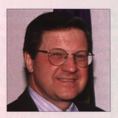
Message from Canada's Minister of Foreign Affairs