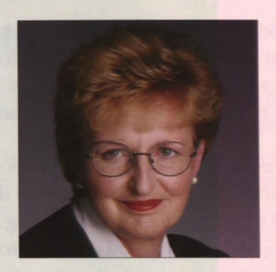
Message from Canada's Minister for International Co-operation and Minister responsible for La Francophonie

This publication focusses on one aspect of Canada's efforts to strengthen human security. Under The Canadian Peacebuilding Initiative , Canada is committed to working together with all