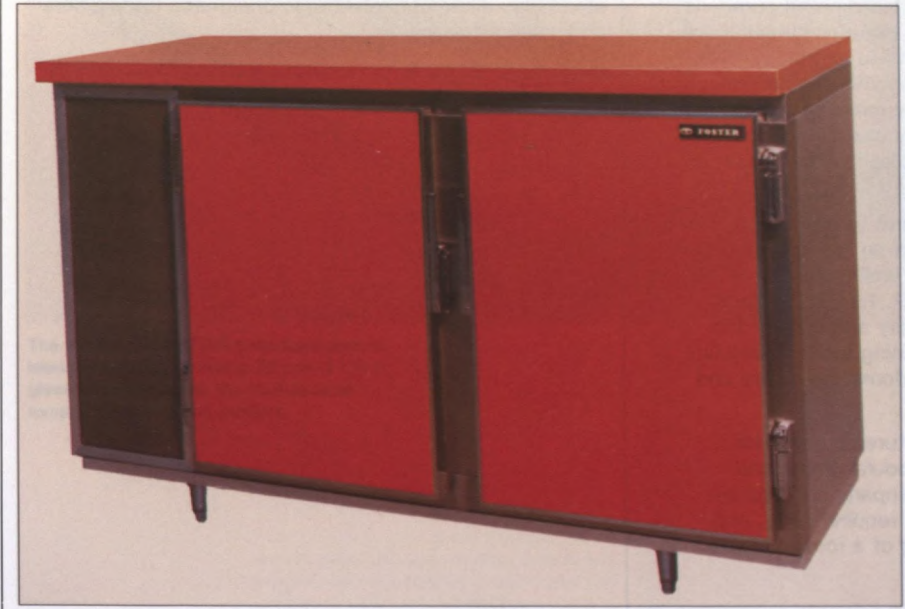
This attractive bar counter keeps up to 56 bottles cool on each tray.

Foster also manufactures blast chillers in a choice of sizes. These high-efficiency units are designed to quick chill from an initial temperature of 74°C to 2.8°C (165°F to 37°F) in 90 minutes per 4 to 5 cm (1 1/2 to 2 in.) thickness. Other Foster products for the food-service industry include attractively styled refrigerated back bars, counters, dual-temperature refrigeration units and pass-through coolers.