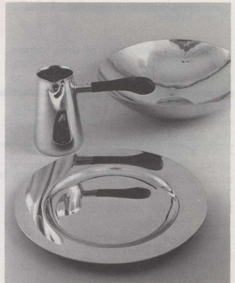
Handmade pewterware by Raymond Cox.

The exhibition is arranged in six sections: fibre, featuring basketry, weaving and textile crafts; glass, including stained glass and free-blown pieces; wood, including bowls, covered boxes, musical instruments and furniture; leatherwork,